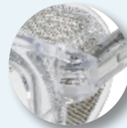
Incorporated metallic hinges