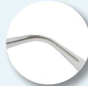
Temples with a metal core