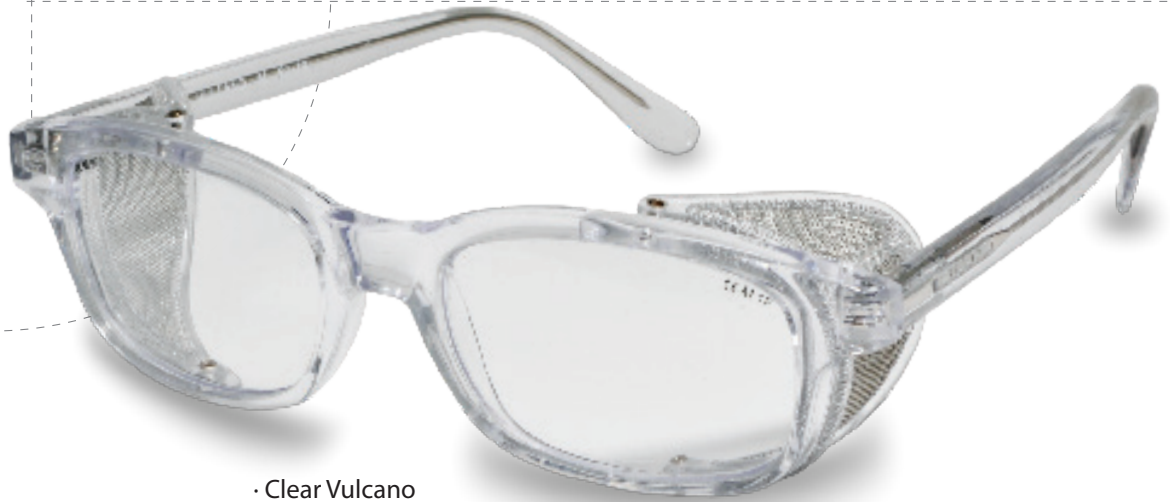
· Clear Vulcano