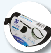
Served in case