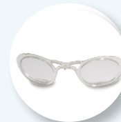
Prescription lens supplement