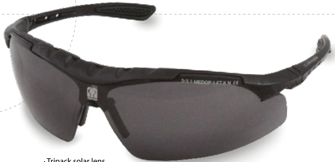
· Tripack solar lens