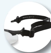
Temples replaceable with strap