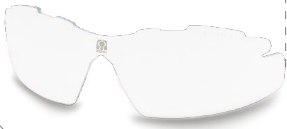
· Tripack clear lens