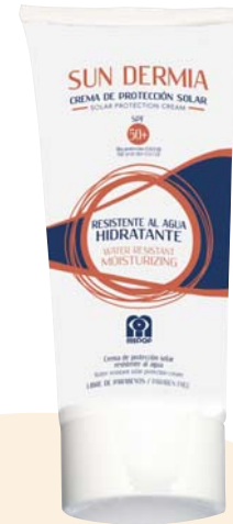
· 100 ml tube