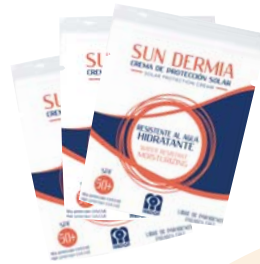
· 3 ml monodose