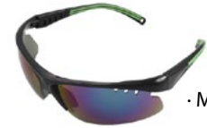
· Mirrored lenses