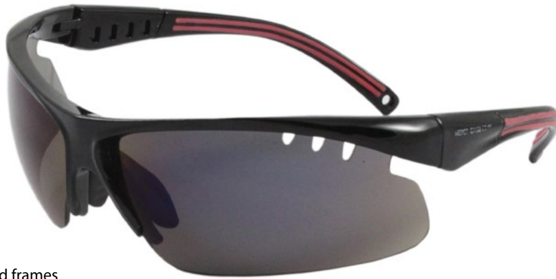
· Red frames