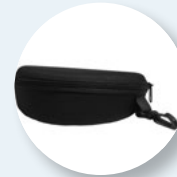
Protective case with carabiner