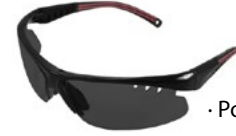
· Polarised lenses