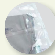
Presentation in individual bags