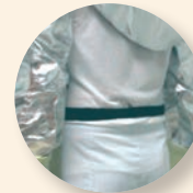
Adjustable waist straps