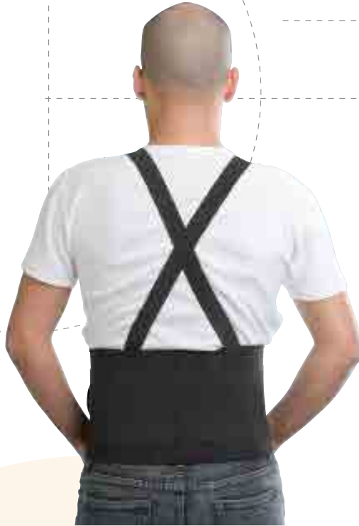
· Lumbar back support belt with suspenders