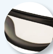
Foam interior that provides comfort and fit