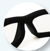
Wide range of CE lenses