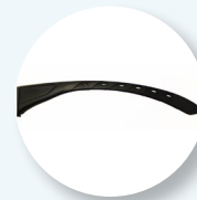
Flat and thin temples