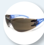
Also in brown solar and clear anti-fogging: FT marking