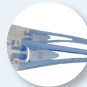
Double-injected temples for greater comfort