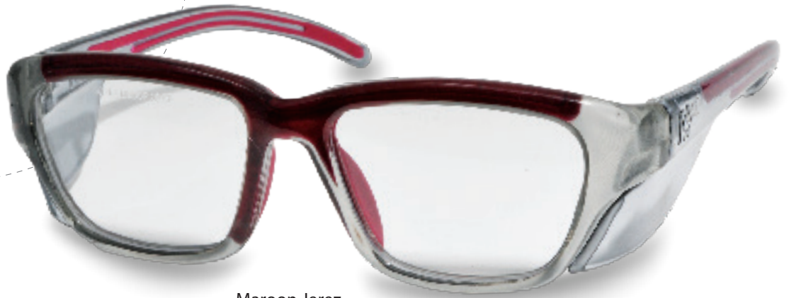
· Maroon Jerez