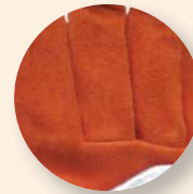
Suede palm: Anti-cut 2