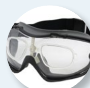
Prescription lens supplement