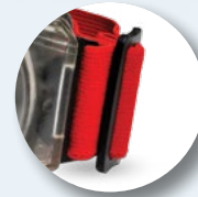
Adjustable elastic strap