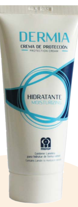
· 100 ml tube