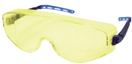
OPTOL VERSION (EN170):

Thanks to the colour of the lens, it provides greater contrast and perception in low light conditions.