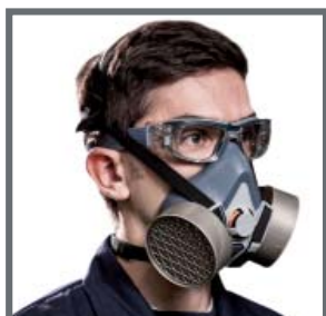
Excellent compatibility with safety spectacles and other PPEs, thanks to the off-centre position of the filters.