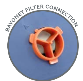
Bayonet filter connection system: safer and easier to adjust. Intuitive connection system.