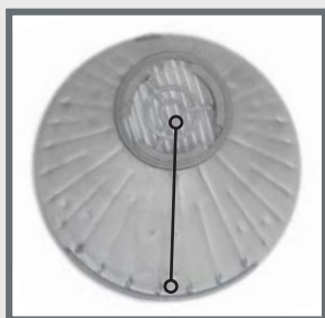
Off-centre connection for placement of the filter: provides a greater field of vision.

BAYONET CONNECTION: GUIDED SEAL SYSTEM, SAFE AND EASY TO ADJUST