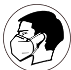
Elastic ear loops